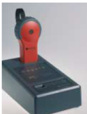
Station box PC