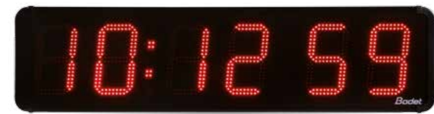
HMS: Hour - Minute - Second