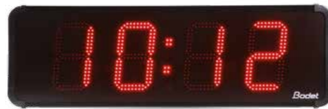
HMT: Hour - Minute - Date - Temperature